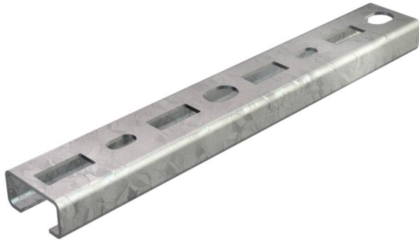
Profile rail, perforated, slot width 16 mm.