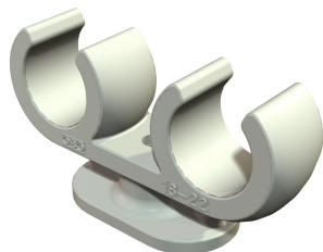
Base clamp clip, two cables 10 mm