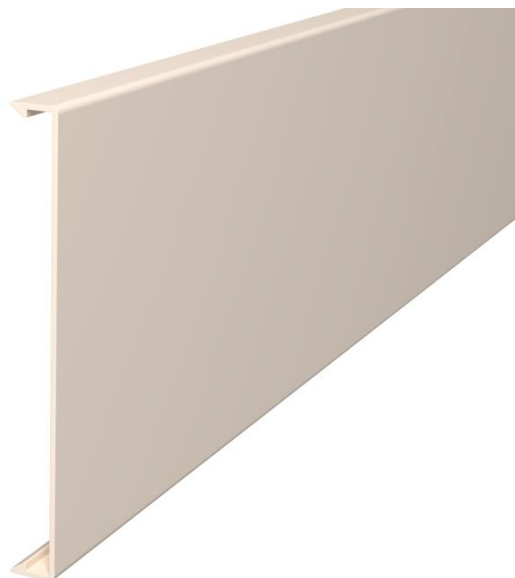
Cover for closing the trunking.